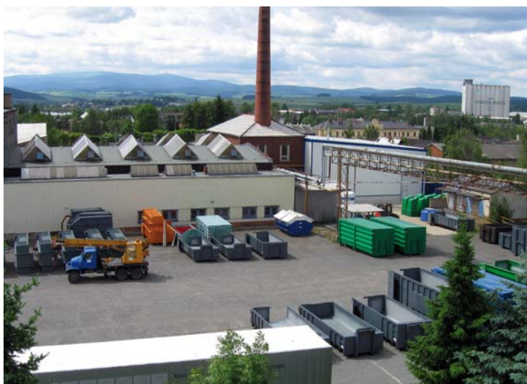
production area in Bruntal

In 2008 we launched rotational moulding line (rotomoulding) to produce polyethylen containers, tanks and other products. This modern and ecological technology enabled us to expand the range of containers and to raise our production capacity.